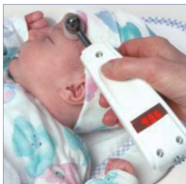
Preferred site is the temporal artery area. Here, behind the ear could be alternate site, as both are exposed