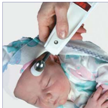
Temporal artery area is the only option here, as the neck area is not exposed