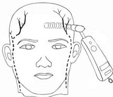
TA thermometer scanning across the superficial temporal artery

Two unexpected major benefits for TA thermometry resulted from the technological development: a cost reduction of 90 percent compared to the standard thermometry methods, and the reintroduction into clinical medicine of what everyone appreciates from a caregiver when they are in need of care – a gentle reassuring touch to the forehead.