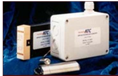
ST-5000 Smart Transmitter