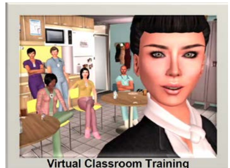
Virtual Classroom Training

Please visit our Main Website at www.exergen.com , Clinical Website at www.Tathermometry.org , Virtual Classroom Training site www.exergen.com/ww , or contact service@exergen.com .