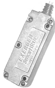
SmartIRt/c.3 (3:1 FOV) & SmartIRt/c.5 (5:1 FOV)

3.71" x 1.37" x 0.76" (94.3 x 34.9 x 19.4 mm)